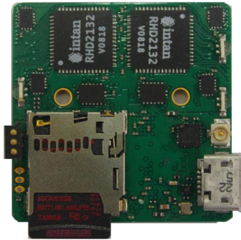
SpikeLog128 Front view

This document is for users of SpikeLog128 who wish to construct their own adapters for connecting to electrode assemblies. Neural inputs to the logger are made to the two 70-pin connectors on the rear of the board. The connectors on the logger board are Hirose part number DF40C-70DP-0.4V(51) or DF40GB-70DP-0.4V(58) . This connector has the advantage of being able to mate with different connectors depending on the desired spacing between the logger and the adapter board. Deuteron's own adapters use DF40HC(3.0)-70DS-0.4V(58) which provide 3mm spacing between the adapter board and the logger board. The highest components on the rear of the logger board are about 1.2mm high. If 2mm spacing, use the DF40C(2.0)-70DS-0.4V(58) receptacle.